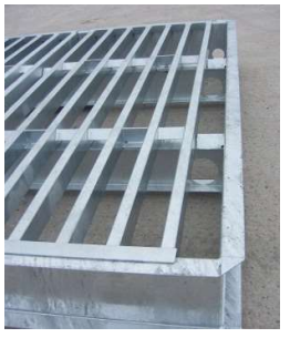
All Steel 122 tonne drop in design